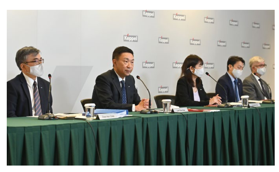
Keppel's senior management actively engaged the investment community in 2022, via results briefings and business update conferences, as well as in-person and virtual meetings.

All announcements are made available on our corporate website immediately after they are released to SGXNet to ensure fair, equal and timely dissemination of information. In 2022, the Company conducted live webcasts of our half-yearly results briefings, and media and analyst teleconferences for our 1Q and 3Q voluntary business updates. Archives of the webcasts, management speeches and presentation materials were made available at our website on the same day the results and business updates are released on SGXNet. Transcripts of the question-and-answer sessions at these briefings were also