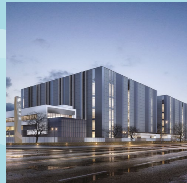
Data centre in Greater Beijing, China