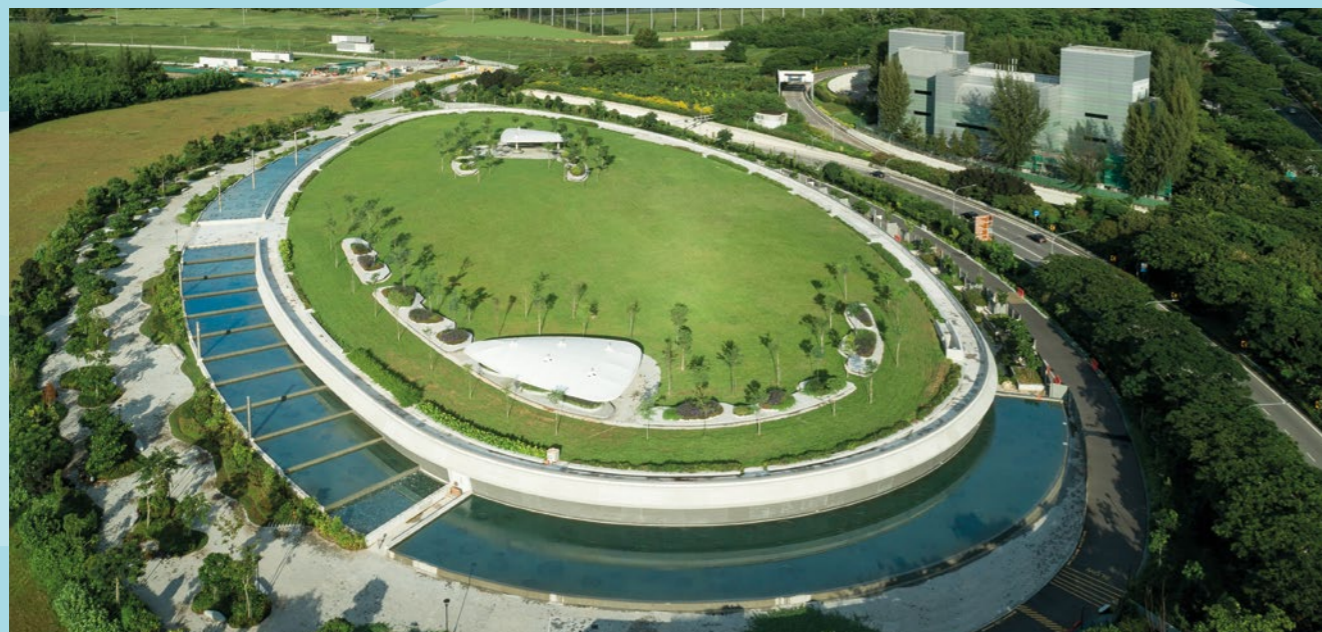
Keppel Marina East Desalination Plant, Singapore