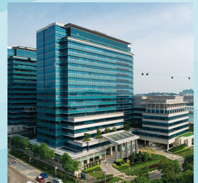
Keppel Bay Tower, Singapore